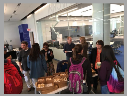
Russia Beyond Putin: A Conversation with an Enemy

Is the War Really Over?: The Challenge in Building Peace in Colombia