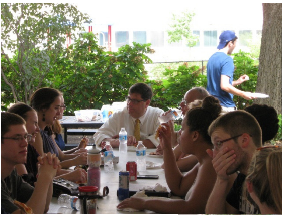
Below: Students interested in Political Science are able build connections.