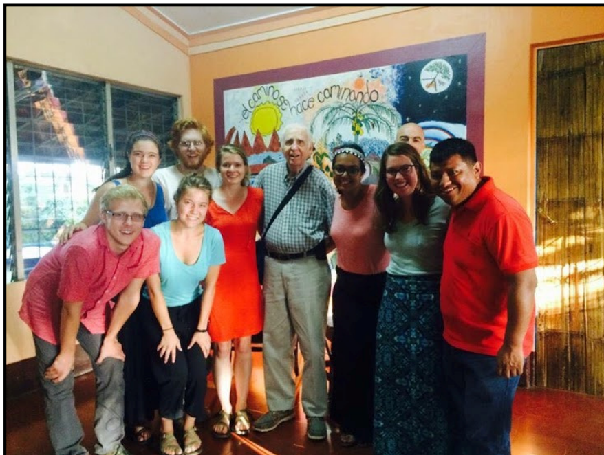
Left: SLU students engage with the community in Nicaragua.