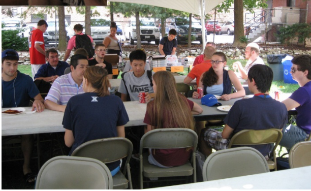
Above: SLU faculty and students get to know each other on a more personal basis.