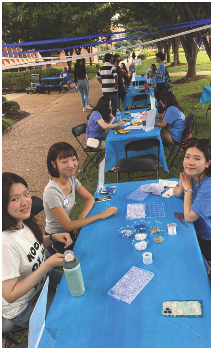
International Student Welcome Party - Aug. 2025